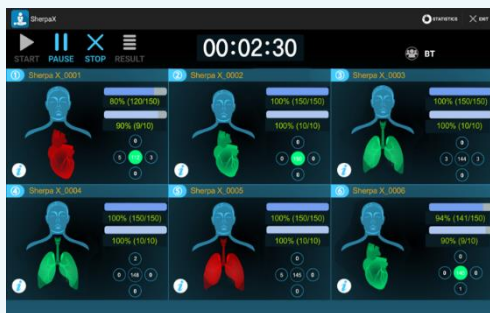
* Group Training